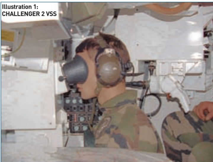
Illustration 1: CHALLENGER 2 VSS

The gap between these two training support packages is filled by CATT which provides what can be termed "Virtual Simulation" , that is to say allowing real people to operate simulated systems with computer imagery providing a virtual environment. This, therefore, is the background to the CATT mission which is to: