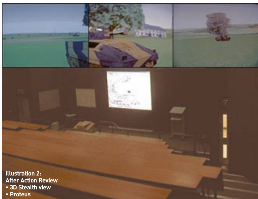
Illustration 2: After Action Review • 3D Stealth view • Proteus

as can a Brigade headquarters, whether all-arms or specialist. All of this can take place, of course, in a multidimensional, extended battle space.