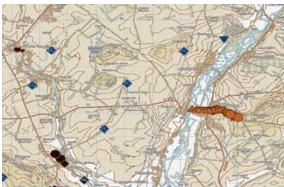
Illustration 3: After Action Review

The system employs three different data bases that in turn allow for both digitised and non-digitised play. It can cope with up to 5 sub-units, that can be combined arms, combat support or combat service support, and from any nation. A full battle group can be trained at any one time,